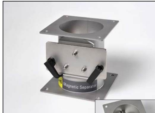
EXTRACTOR (without slide gate)