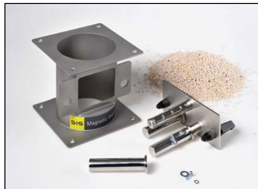
Cleaning the EXTRACTOR