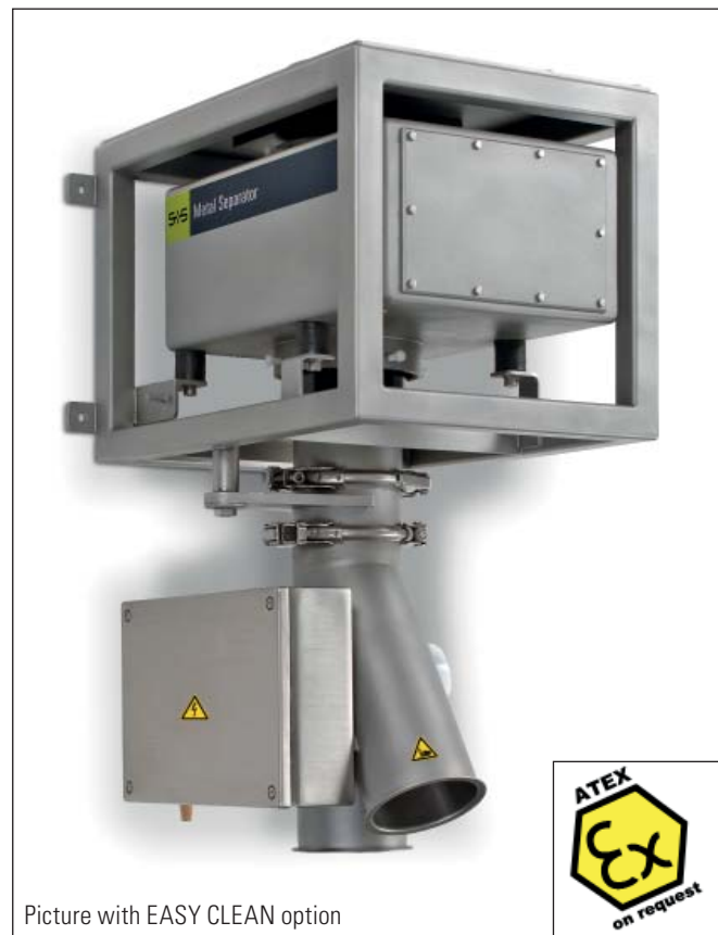
Picture with EASY CLEAN option