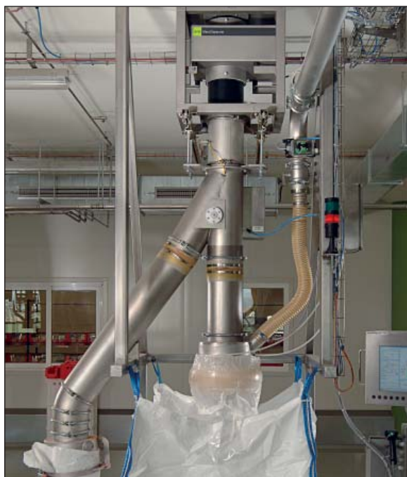
IFS compliant metal detection directly before the filling of spice products into bigbags.