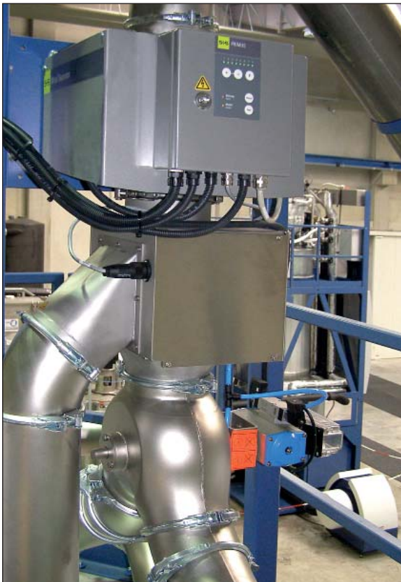
Metal separator RAPID VARIO-FS used for the quality control of PET regenerate.