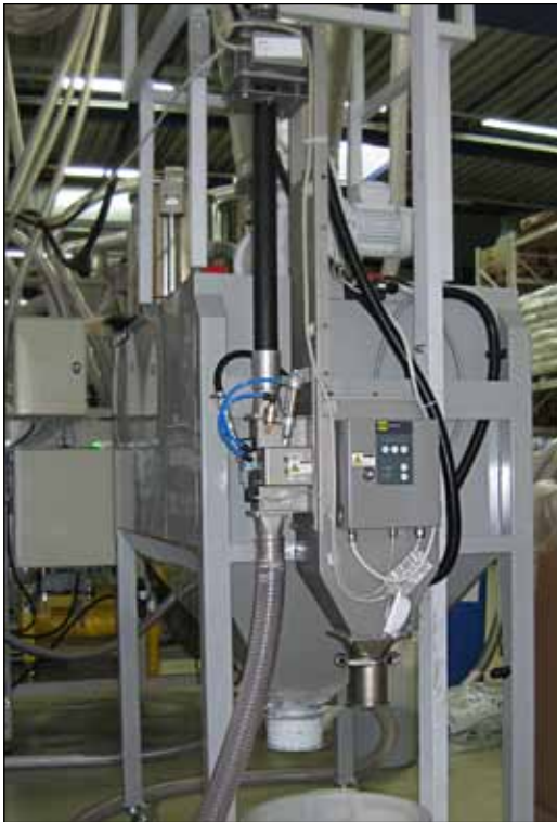
GF metal separator installed in a vertical conveyor pipe

GF PRIMUS metal separators can be integrated and also retrofitted in horizontal, vertical and inclined vacuum and pressure pipes.